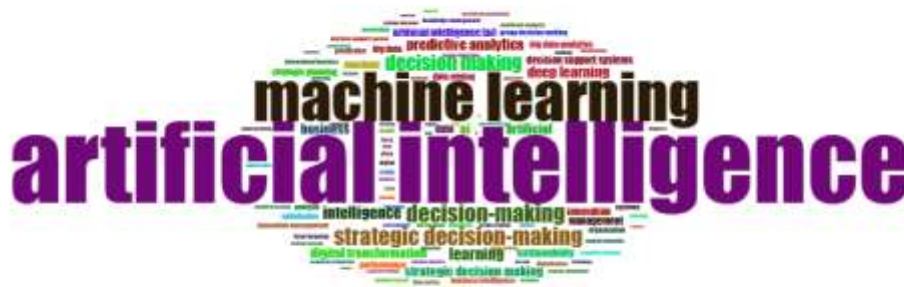
Figure 1. Word cloud for the 303 works

The central focus of this paper is given by the duality of the analyzed context, namely that of AI-assisted decisions and the type of decisions. In contrast to these, the results aimed to identify, for a start, the terms that receive the most attention when both contexts are taken into consideration. For this reason, the first analysis that was carried out was that of a word cloud. A scheme intended to present in an interactive manner the main topics of the 303 papers (Figure 1).